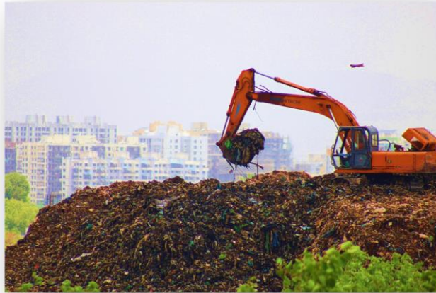
Total MSW Handled